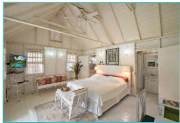
Chattel house bedroom