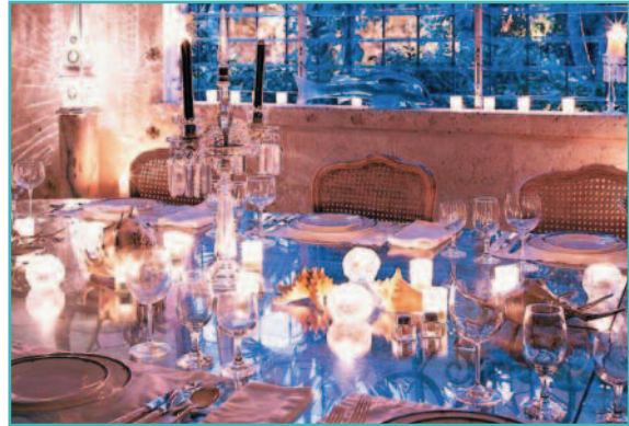
Formal indoor dining room