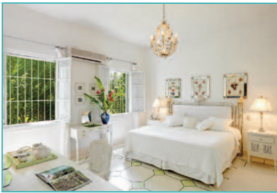
A master bedroom

There are 7 en suite bathrooms in the main house and the cottage, (one bedroom has two bathrooms), and 1 powder room. Master bathrooms have showers only. The South Wing bedroom has his and hers bathrooms with showers. The cottage bathroom has a combination bath/shower. North Wing bathrooms have bath/showers. The Chattel Houses have their own toilet/shower.. Each sleeping accommodation is individually air-conditioned. All air conditioners in the bedrooms and study are quiet, split systems with remote temperature control.