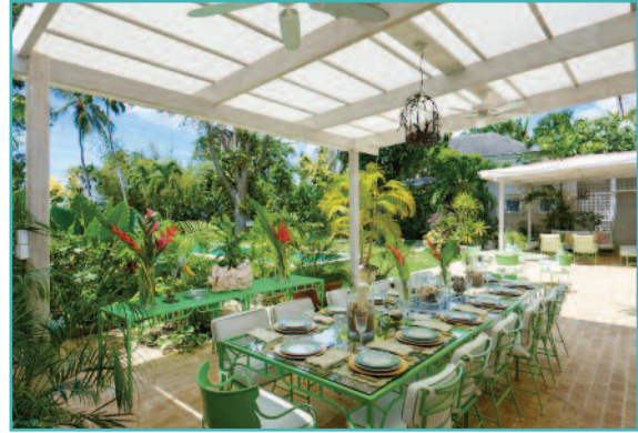
Dining on terrace

Nelson Gay, fronting one of Barbados' best beaches, is discreetly screened by its own tropical gardens for total privacy.