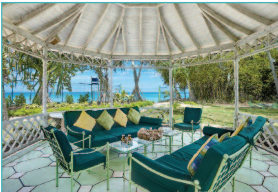
Gazebo next to the ocean