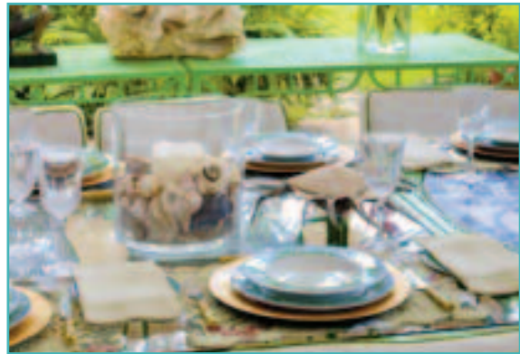
Lunch is served