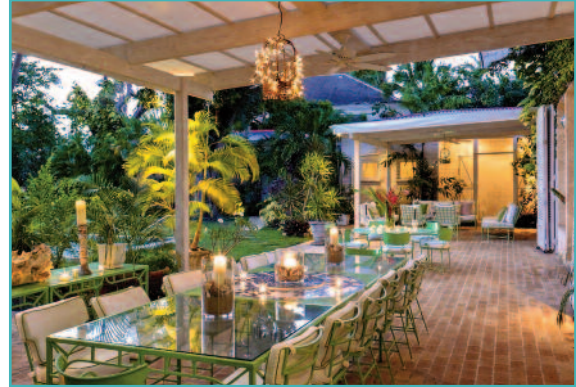
Dining on terrace