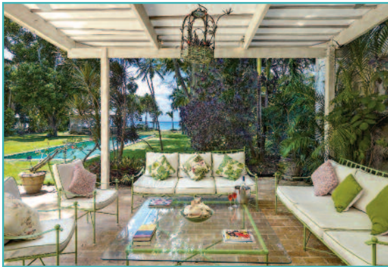
Sitting area on terrace