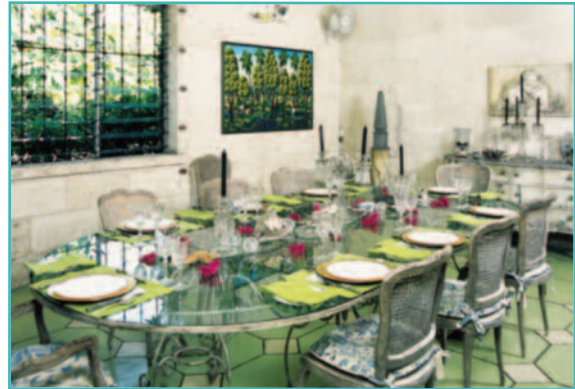
Formal dining room