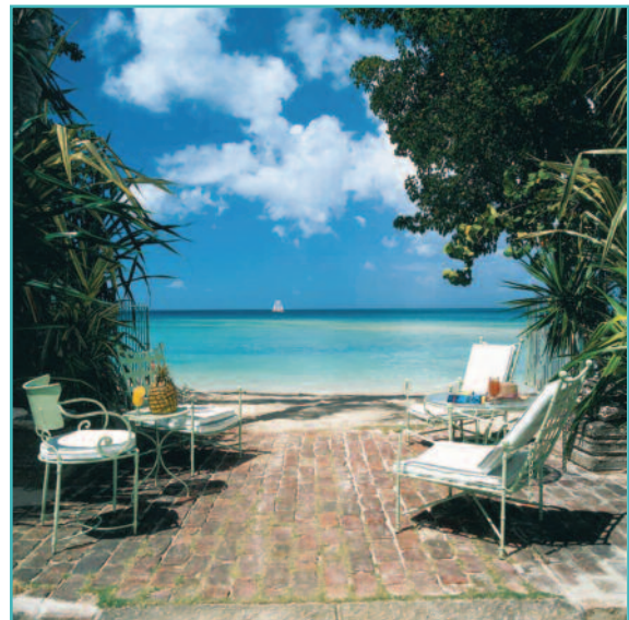
Exit to beach

This elegant coral stone Palladian mansion is set in a lush tropical estate of nearly two acres. Built for a U.S. Ambassador over 50 years ago, the timeless good taste this property offers is hard to find in more recent properties. However, it has been kept up to date with modern amenities. The surrounding gardens reflect the sure touch of the original designer and have matured to become some of the best on the island. The focal point of the garden is a 50' heated pool which can be fenced off if required.