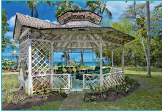
Gazebo next to the ocean

The elegant garden gazebo by the beach seats up to 14. It is equipped with a wet bar and fridge. A dining table on the partly covered terrace can seat up to 20. The formal dining room features a glass topped table by Oliver Messel and seats up to 12.