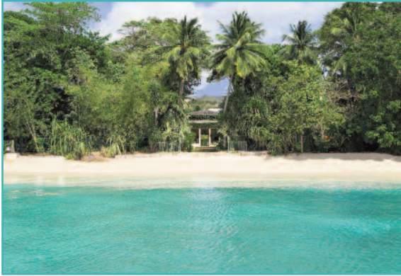
House from the ocean