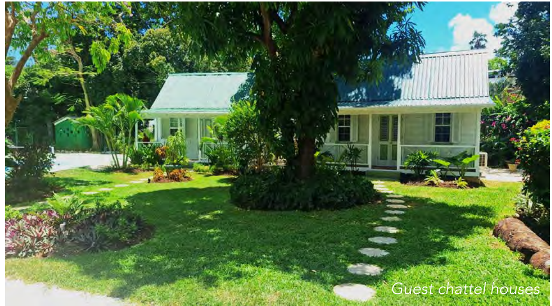
Guest chattel houses