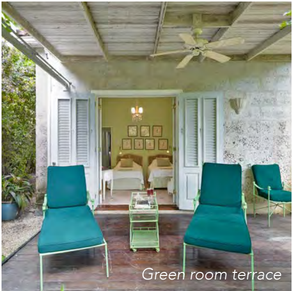
Green room terrace