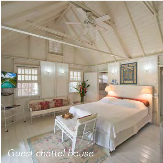
Guest chattel house