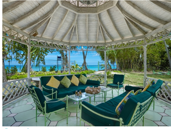
Gazebo next to the Ocean

Erté visited Nelson Gay numerous times, staying in what the owner now calls the Erté Bedroom. As a gesture of gratitude and friendship, Erté painted a black mermaid on the bedroom wall, which remains there to this day.