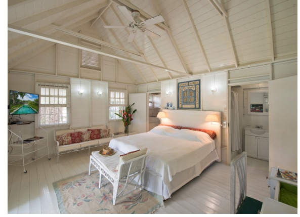
Guest Chattel house