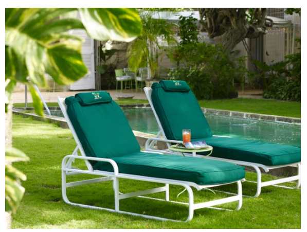
Relax by the pool