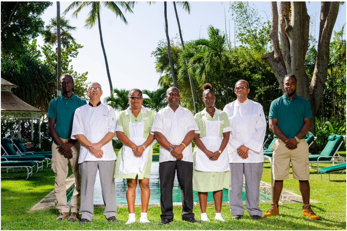
Staffing levels depend on the number of guests and season.