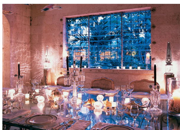
Formal indoor dining