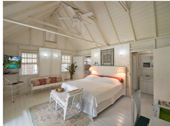
Inside guest Chattel house

Address: Road View, St. Peter, Barbados.