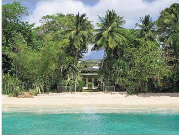
House from the Ocean