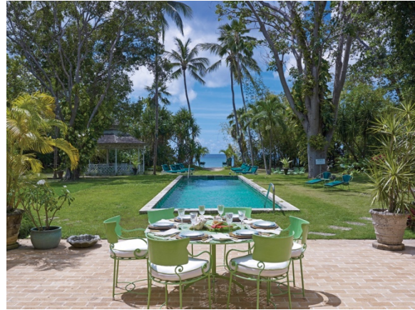
Outdoor dining options

Nelson Gay, fronting one of Barbados' best beaches, is discreetly screened by its own tropical gardens for total privacy.