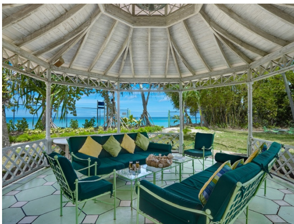
Gazebo next to the Ocean

Erté visited Nelson Gay numerous times, staying in what the owner now calls the Erté Bedroom. As a gesture of gratitude and friendship, Erté painted a black mermaid on the bedroom wall, which remains there to this day.