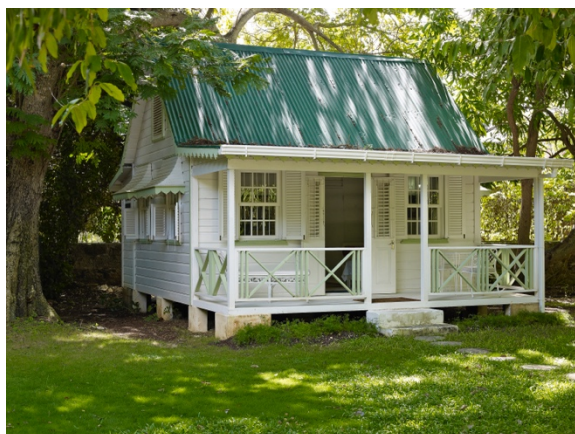
Guest Chattel house