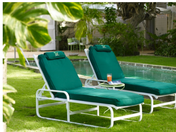
Relax by the pool