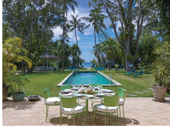
Outdoor dining options

Nelson Gay, fronting one of Barbados' best beaches, is discreetly screened by its own tropical gardens for total privacy.