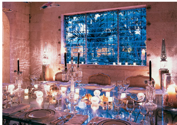
Formal indoor dining