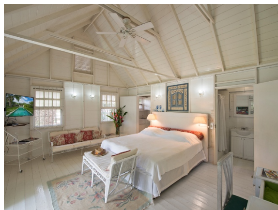
Inside guest Chattel house