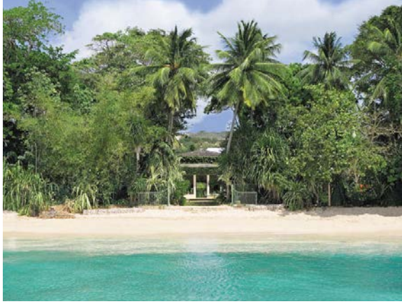
House from the Ocean