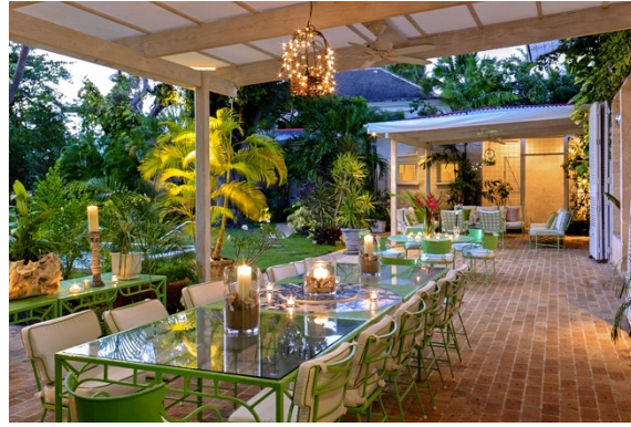
Outdoor Terrace Dining

Located on the favoured and exclusive West Coast, Nelson Gay's garden gates open on to a stunning half-mile crescent beach. The clear, sheltered water is roped off for safe swimming and is ideal for all water sports and snorkelling. Nelson Gay is child friendly – all on one level – making it perfect for family or group holidays.