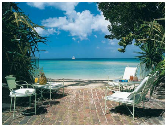
Exit to beach

This elegant coral stone Palladian mansion is set in a lush tropical estate of 1.5 acres. Built for a US ambassador over 50 years ago, the timeless good taste this property offers is hard to find in more recent properties. However, it has been kept up to date with modern amenities. The surrounding gardens reflect the sure touch of the original designer and have matured to become some of the best on the island. The focal point of the garden is a 50' heated pool which can be fenced off if required.